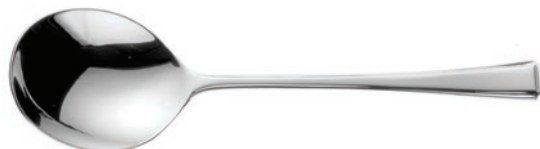
Soup Spoon 18cm