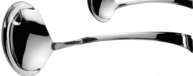
Soup Ladle 26cm