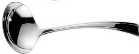
Sauce Ladle 16cm