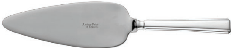
Pie Knife 25.5cm