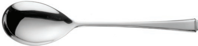
Salad Server Spoon 22.5cm