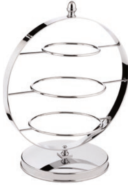
Table Tea Stand Contemporary