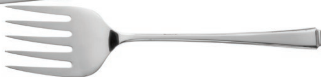
Fish Carver Fork 22cm