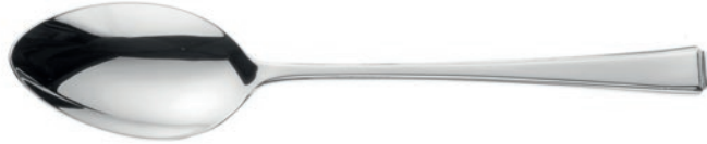
Table Server Spoon 22cm