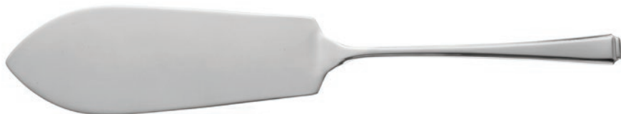
Fish Carver Knife 31cm