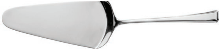
Flanged Cake Lifter 24cm