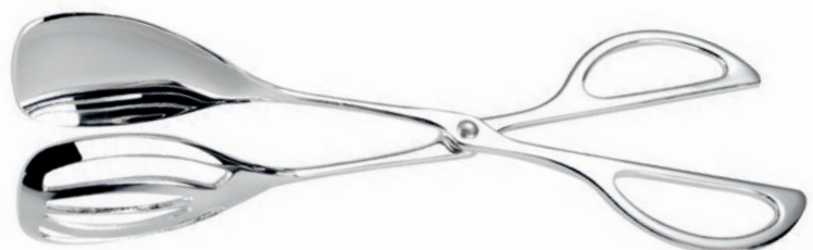
Scissor Tongs 25cm