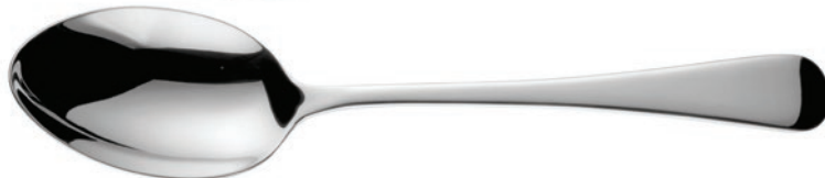
Serving Spoon 25cm