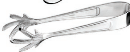
Ice Tongs 15.5cm