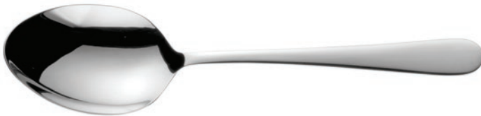
Serving Spoon 23cm