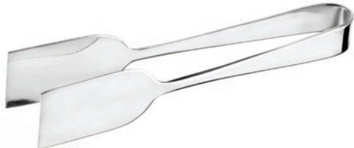
Sandwich Tongs 17cm