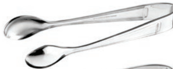
Sugar Tongs 11.5cm